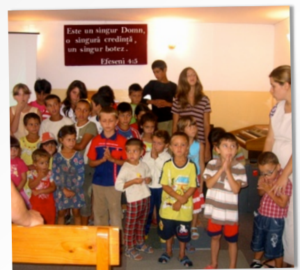
KIDS WORSHIP TOO