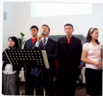
THE PRAISE & WORSHIP GROUP