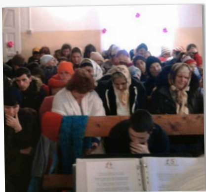
THE CHURCH AT WORSHIP

blessed their ministry, so that 6 years later the mission grew from a family to 28 baptised members, not counting the children and the visiting friends. The mission grew from one mission filed to three and even a mission abroad, in Moldavia . God has blessed the Church with various ministries, such as a praise and worship group that is there to help to pretty much every evangelism service in the County, a children ministry and much more.